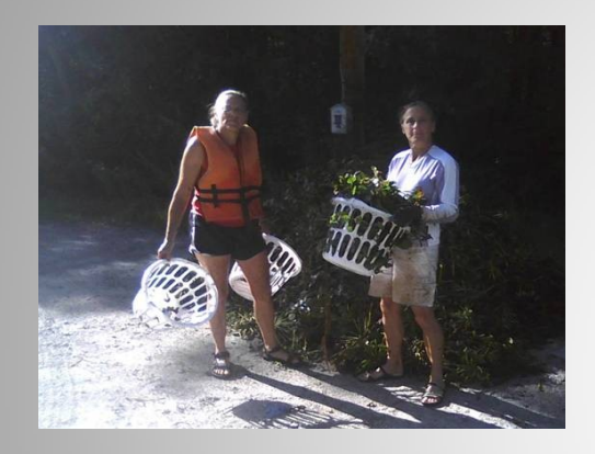
Tools of the trade