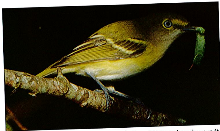
Like most songbirds, the white-eyed vireo ( Vireo griseus ) rears its young on insects.

The second reason is that it takes time—long evolutionary time spans, rather than short ecological periods—for most insects to adapt to the specific chemical mix that characterizes dif-