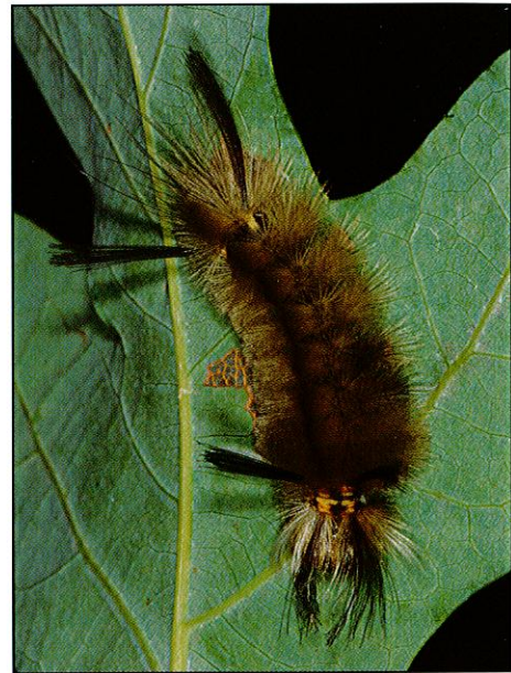
Banded tussock moth ( Halysidota tessellaris ) caterpillars feed on a range of native trees from July to October.

How do we know the actual extent to which our native insects are eating introduced plants? My students and I