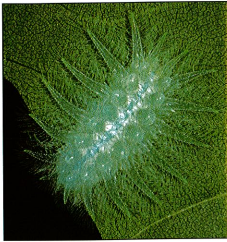
The spun glass moth ( Isochaetes beutenmuelleri ) caterpillar is a specialist of oaks.

pillars. Oaks supported the most species (534), followed by native cherries (456), willows (455), and birches (413), while there were some natives, such as sweet-spire ( Itea ) and yellowwood ( Cladastris ), on which no Lepidoptera were recorded. As predicted, favorite landscape plants that evolved elsewhere such as forsythia, golden raintree, Zelkova , and Metasequoia , supported few or no caterpillar species. All members of the thirty-eight most productive genera were native to the mid-Atlantic region, with the exception of pear ( Pyrus ), an agricultural genus. Among ornamental plants, natives supported on average seventy-four species of native Lepidoptera, while aliens supported fewer than five—just one-fifteenth as many.