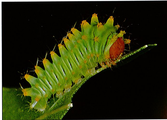
Native trees—particularly oak, maple, and willow—are required food for caterpillars of the polyphemus moth ( Antheraea polyphemus ).

In 2000 my wife and I moved to ten acres in Pennsylvania. The area had been farmed for centuries, before being subdivided and sold to people like us who wanted a quiet rural setting close